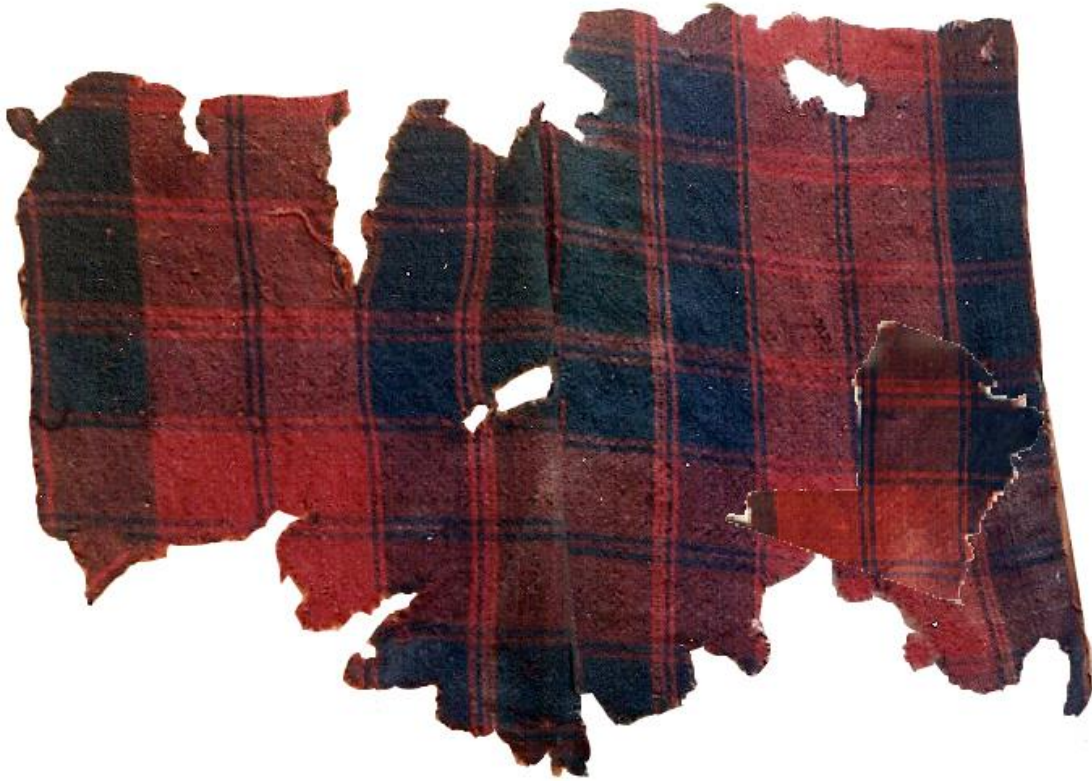
Plate 5. Alignment of the Struy and Scarlett fragments.

In 2016 the author stumbled across a larger piece of the original plaid in a collection belonging to the Inverness Museum (Plate 6). A comparison of the dimensions of that piece with the one photographed by Scarlett suggest that they are not the same and that that specimen is must be elsewhere, probably in private hands..