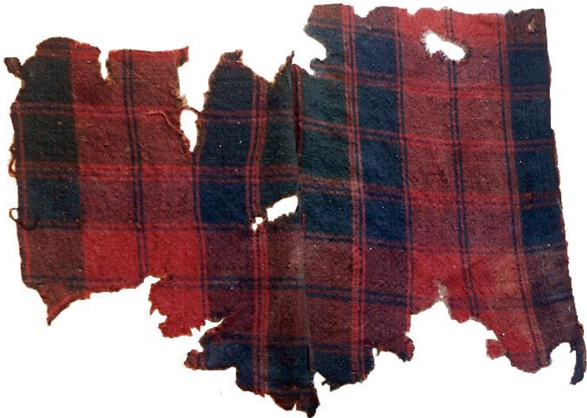
Plate 3. Unnamed C18th specimen ( Fraser of Altyre ?) from the Scarlett Collection.