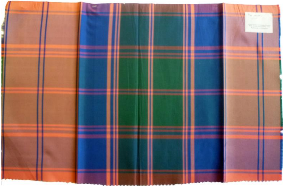
Plate 1. Fraser of Altyre, silk sample from Andersons.