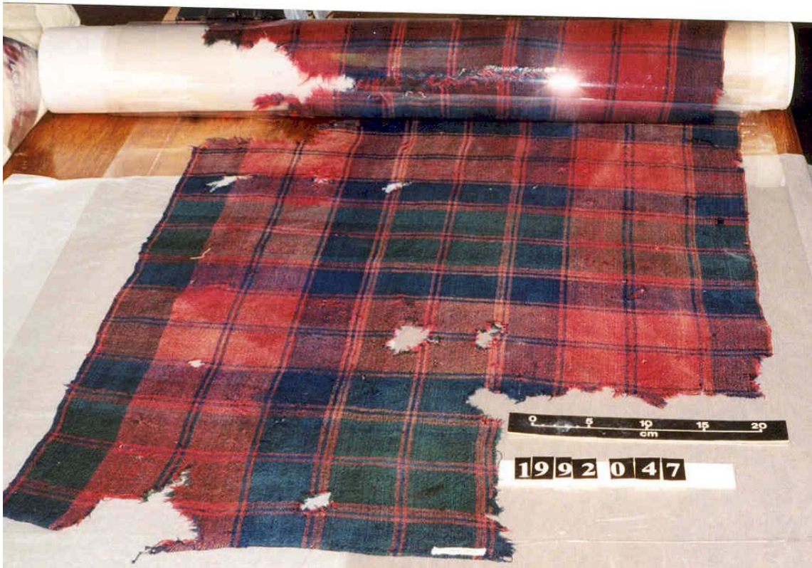
Plate 6. Larger portion of the Struy plaid.

In 2016 the author stumbled across a larger piece of the original plaid in a collection belonging to the Inverness Museum (Plate 6). A comparison of the dimensions of that piece with the one photographed by Scarlett suggest that they are not the same and that that specimen is must be elsewhere, probably in private hands..