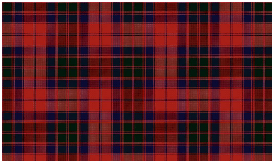
Fig 8. Reconstruction of the tartan in Fraser of Struy's plaid.

Despite the offset layout of the warp being intended for joining, there is no evidence on the surviving specimen that it was ever actually joined. This does not mean that it wasn't, simply that there is no surviving thread to show that it was; however, other surviving examples of offset plaiding used singly show that such cloth was not always joined as intended by the weaver. Irrespective of whether the cloth was joined or used single width, the overall design is that given at Plate 7.