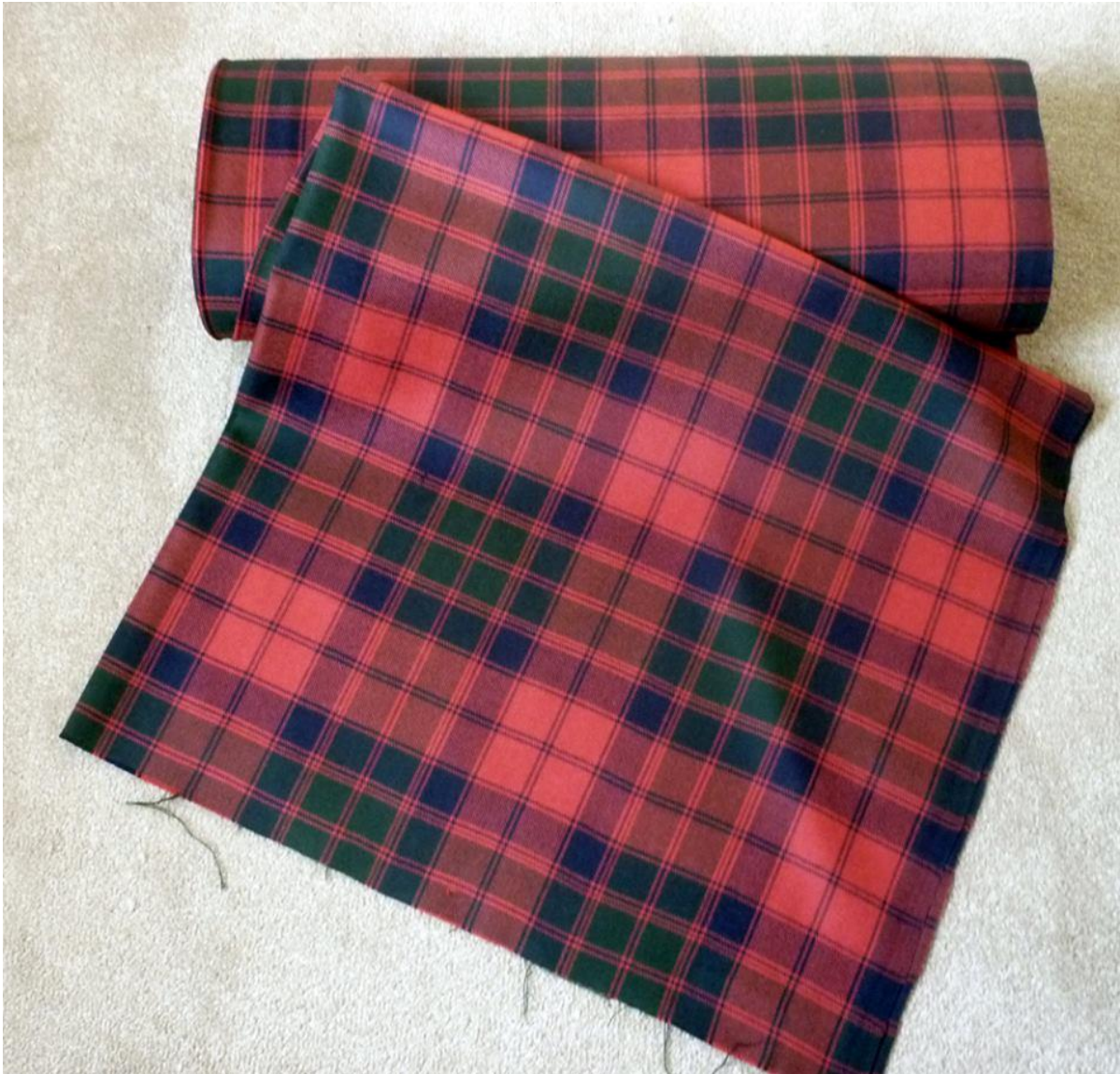
Plate 8. Reconstruction of the tartan in Fraser of Struy's plaid.

In 2017 the author commissioned a special run of double width cloth matched to the original specimen (Plate 8).